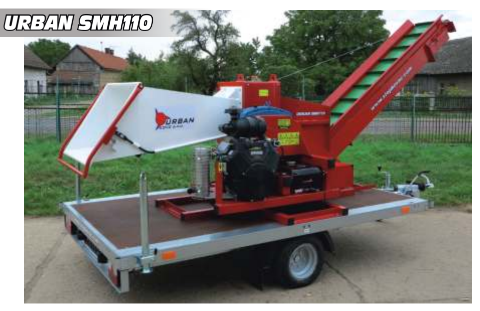
Model being produced: