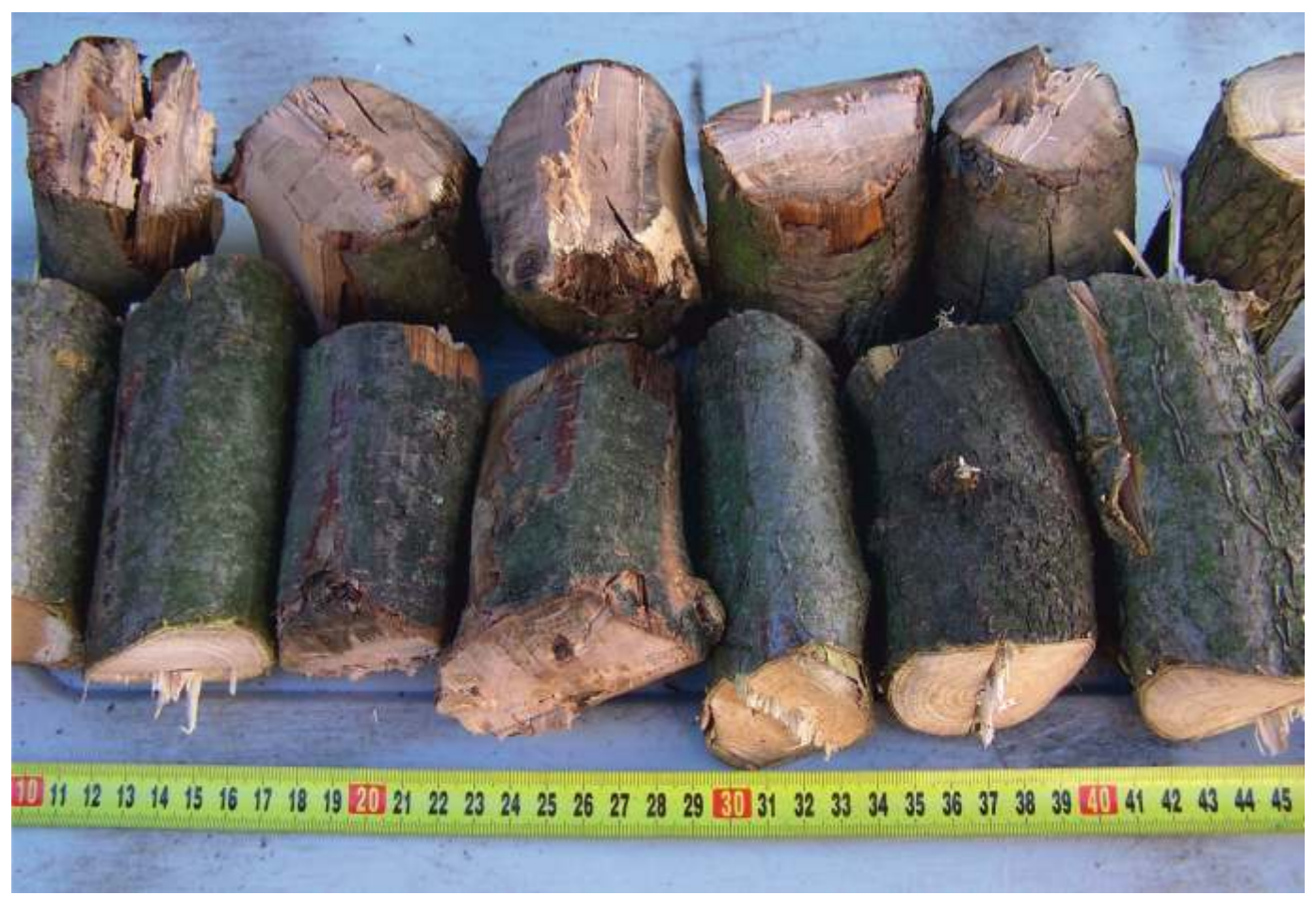
Small logs from 70 series of branch loggers