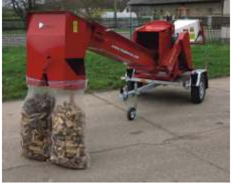
The double bagging frame for raschle bags with a supporting leg can be mounted to any belt conveyor. Easily installed with 4 screws.